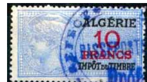
1929. Daussy design (Marianne at left). Inscriptions in deep brown (centime values) or in black (franc values), value in second colour stated. No wmk.