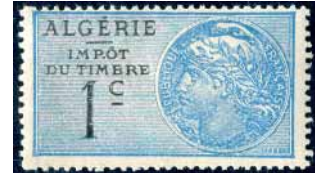
1922. Marianne in medallion at right.. No wmk.

These Impot du Timbre stamps played the same role as Timbre Fiscal stamps in France, being stamps for general revenue purposes. Sometimes found with postal cancels, these were not used to pay postage but derive from money order forms, telegraph receipts, or other postal documents requiring a payment and receipt.