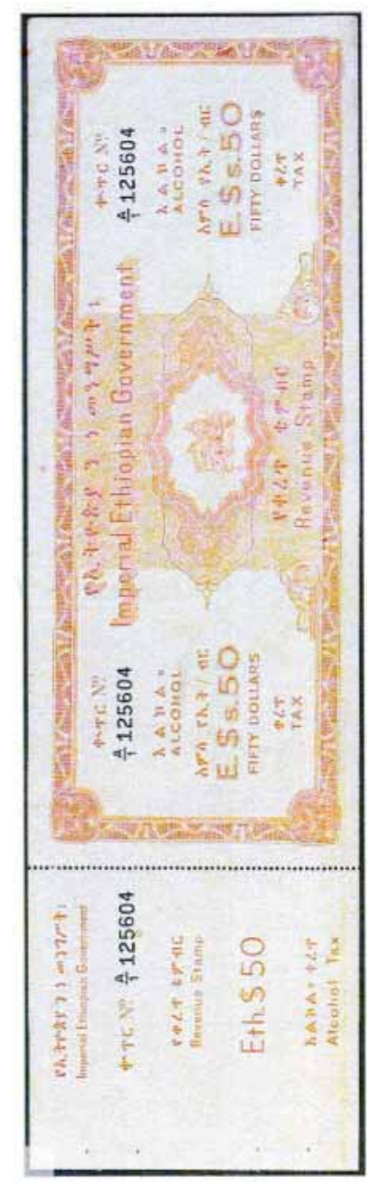
c1950. With tab at left. Recess printed (Waterlow). Serial number in black. Imperf three sides. perf between stamp and tab. (7. $25)