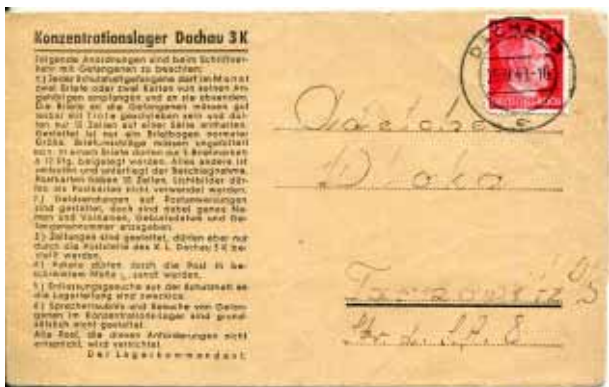
024869. DACHAU : 12pf Hitler on printed Dachau letter sheet, DACHAU cds, boxed Dachau censor cachet, to Tarnowitz, 1943 ..... £75.00