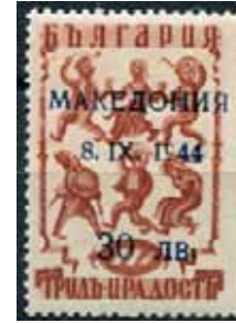
024765. OVERPRINT VARIETIES : 30L on 14L, variety "broken 9" in "1944", unmounted mint, cat 80 Euros ..... £35.00