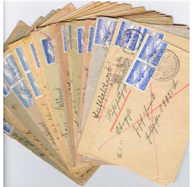
021616. AIRMAIL : batch of 25 covers all with blue Feldpost stamps (perf and rouletted, some pairs), all from the homeland to various FPOs on the front ..... £195.00