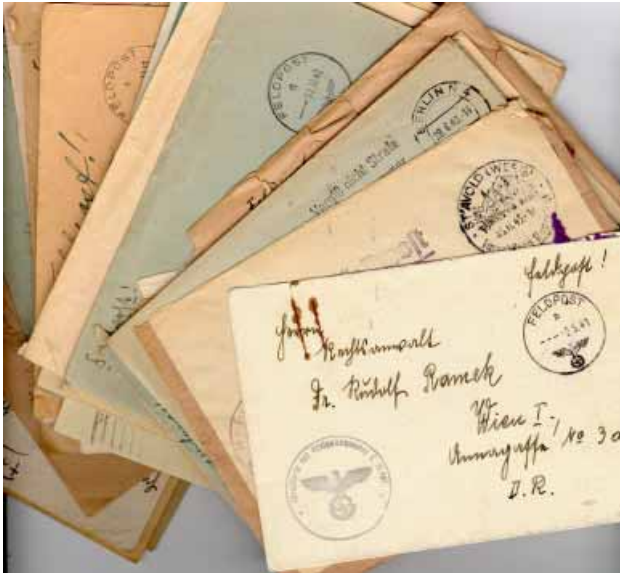
021644. ACCUMULATION : about 50 feldpost covers with wide variety of 5-digit Feldpost numbers and eagle cachets, from soldiers on service, to the homeland ..... £225.00