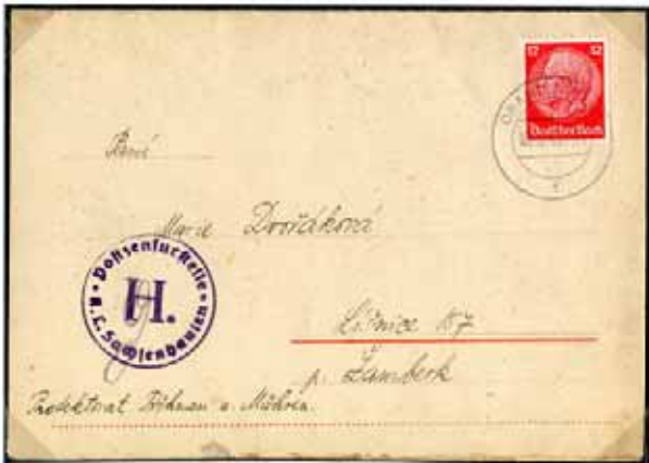
013187. CONCENTRATION CAMP MAIL : Sachsenhausen, lettersheet (Simons type 7) with 12pf Hindenburg, ORANIENBURG cds, censor cachet "H" of Sachsenhausen, from Jaroslav Dvorak, to Zamberk, Bohemia, 1941 ..... £60.00