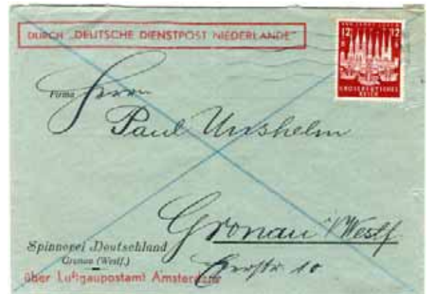
024115. DIENSTPOST : cover with 1943 Lübeck (SG 850), red DIENSTPOST NIEDERLANDE and red "über Luftgaupost Amsterdam", dumb roller cds (of Amsterdam), to Gronau, c1943 ..... £35.00