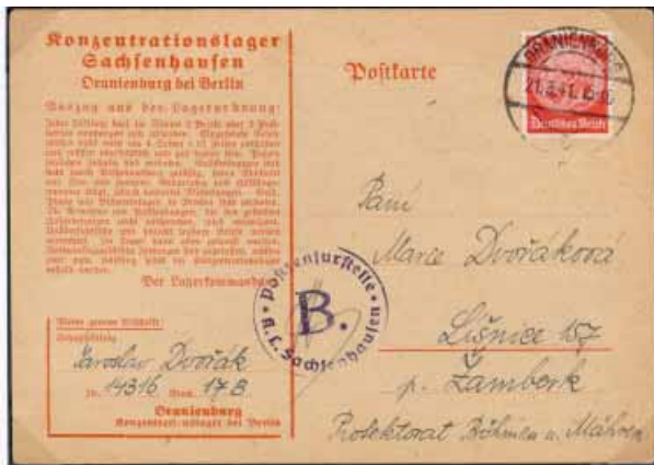
013192. CONCENTRATION CAMP MAIL : Sachsenhausen, printed postcard (Simons type 2) with 12pf Hindenburg, ORANIENBURG cds, censor cachet "B" of Sachsenhausen, from Jaroslav Dvorak, to Zamberk, Bohemia, 1941 ..... £60.00