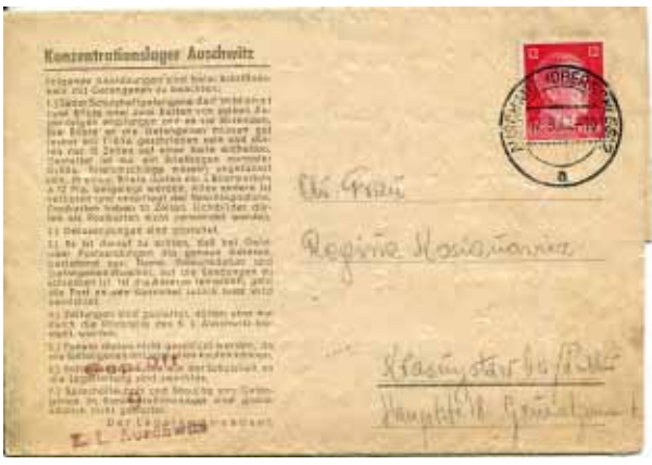
024872. AUSCHWITZ : 12pf Hitler on printed Auschwitz letter sheet, AUSCHWITZ cds, Auschwitz 9 censor cachet, to Lublin, 1942 £75.00