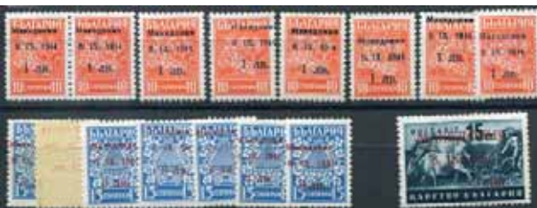
024762. OVERPRINT VARIETIES : selection of 8 x 1L, 7 x 3L, and one 9L, all with varieties e.g. !1941", "1914", misplaced, offset, broken "9 LV" etc, all unmounted mint (16 stamps) ..... £75.00