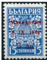
024763. OVERPRINT VARIETIES : 1L on 15st, variety "9" type I (Mi 1 I unmounted mint, cat 120 Euros) ..... £45.00