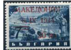
024766. OVERPRINT VARIETIES : 20L on 7L, variety two lines instead of three (Mi 7 VI, cat 200 Euros) unmounted mint ..... £75.00