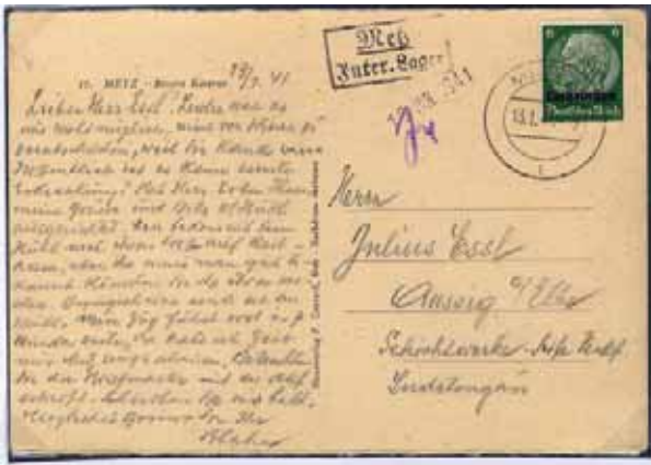
013550. INTERNEE CAMP : viewcard with boxed "Metz/ Inter. Lager" camp cachet, Lorraine 6pf ovpt Hindenburg with METZ cds, censor datestamp alongside, to Aussig, 1941 ..... £60.00