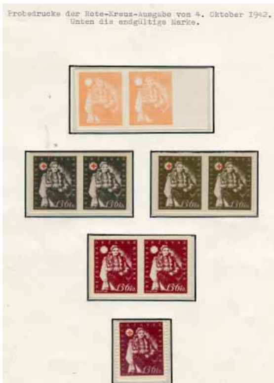
018146. 1942 RED CROSS SET : the set of five plus the tax stamp (Mi 86/90+Z1, SG 67/71a), 24 different progress proofs all in pairs (total 48 proofs) plus the issued set (photo of one album page) ..... £180.00

003813. 1943 POSTAGE DUE : 2k Numeral (SG D75, Scott J22) colour trial in claret and light blue, background printed twice, imperf block of 8, mint ..... £20.00