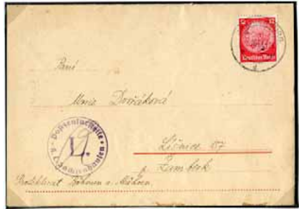
013190. CONCENTRATION CAMP MAIL : Sachsenhausen, lettersheet (Simons type 7) with 12pf Hindenburg, ORANIENBURG cds, censor cachet "L" of Sachsenhausen, from Jaroslav Dvorak, to Zamberk, Bohemia, 1941 ..... £60.00