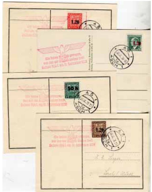
025251. ASCH : 50h on 25h, 1,20 on 10h, 1,20 on 20h, 1,20 on 50h, each on philatelic card with ASCH cds and Nazi eagle comm cachet £35.00