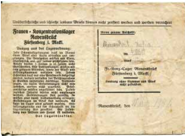
024873. RAVENSBRÜCK : inner letter sheet (no cover or stamps) from prisoner 4060, 1941, together with research notes indicating arrived on transport from Poland 1940 ..... £60.00