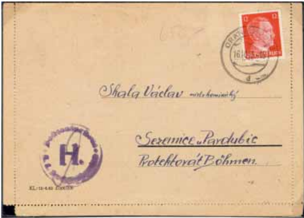
013198. CONCENTRATION CAMP MAIL : Sachsenhausen, lettersheet (Simons type 5) with 12pf Hitler, ORANIENBURG cds, censor cachet "H" of Sachsenhausen, from Skala Vaclav, to Pardubic, Bohemia, 1943 ..... £60.00