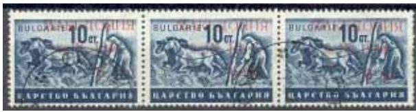
022964. 1944 PICTORIALS : 6L on 10st (Mi 3 IV/II), used strip of three from positions 21-23, showing open "4" and other minor positional varieties ..... £45.00