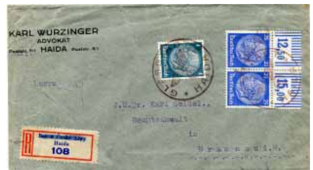
024773. HAIDA : regd commercial cover with Germany 4pf, 2 x 25pf Hndenburgs, GLASSTADT / HAIDA Nazi eagle cachets as cancellers, to Braunau, 1938 ..... £35.00