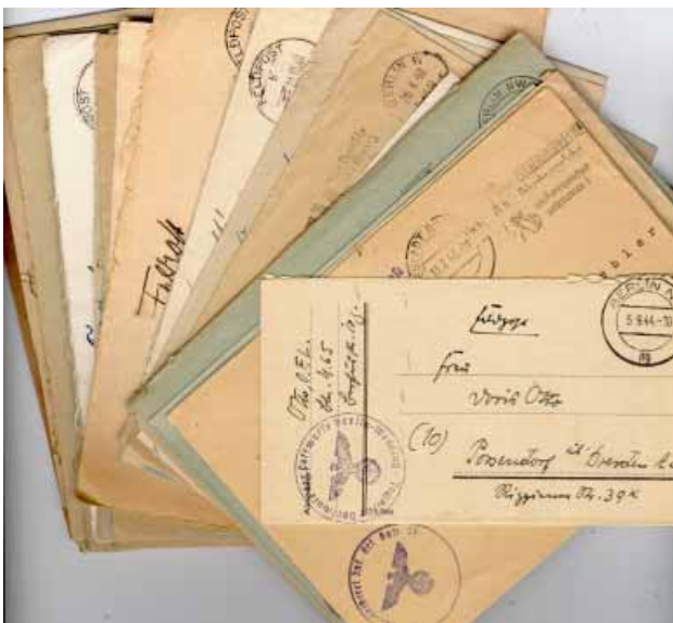
021645. ACCUMULATION : about 40 feldpost covers with wide variety of 5-digit Feldpost numbers and eagle cachets, from soldiers on service, to the homeland ..... £180.00