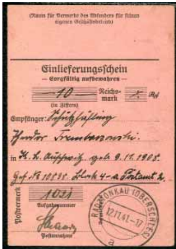
024874. AUSCHWITZ : money order receipt stub from RADZTONKAU cds, addressed to a prisoner at Auschwitz, 1941 ..... £35.00