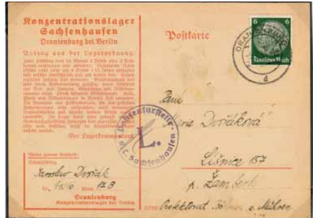
013196. CONCENTRATION CAMP MAIL : Sachsenhausen, printed postcard (Simons type 2) with 6pf Hindenburg, ORANIENBURG cds, censor cachet "L" of Sachsenhausen, from Jaroslav Dvorak, to Zamberk, Bohemia, 1941 ..... £60.00