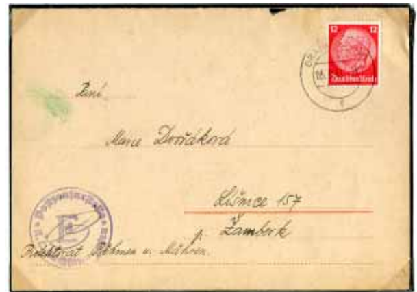
013182. CONCENTRATION CAMP MAIL : Sachsenhausen, lettersheet (Simons type 7) with 12pf Hindenburg, ORANIENBURG cds, censor cachet "E" of Sachsenhausen, from Jaroslav Dvorak, to Zamberk, Bohemia, 1941 ..... £60.00