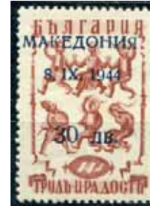
024764. OVERPRINT VARIETIES : 30L on 14L, variety "9" type II (Mi 8 II unmounted mint, cat 80 Euros) ..... £35.00