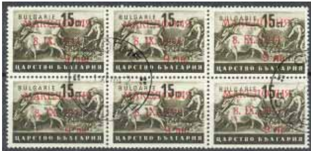
022966. 1944 PICTORIALS : 9L on 15st brown (Mi 5 V/II), used block of six from positions 1-3, 11-13, showing open 2nd "4" and other minor positional varieties ..... £50.00