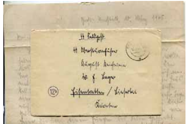
024746. SS FELDPPOST : cover from SS member at GROSS-UMSTADT cds to a fellow SS member in Austria, March 1945 with lengthy handwritten personal letter. This was a month before American capture of Gross-Umstadt. .... £35.00