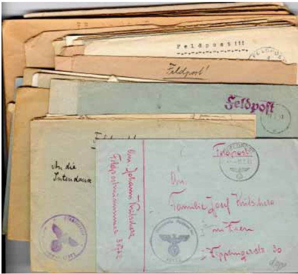
021646. ACCUMULATION : about 60 feldpost covers with wide variety of 5-digit Feldpost numbers and eagle cachets, from soldiers on service, to the homeland ..... £270.00