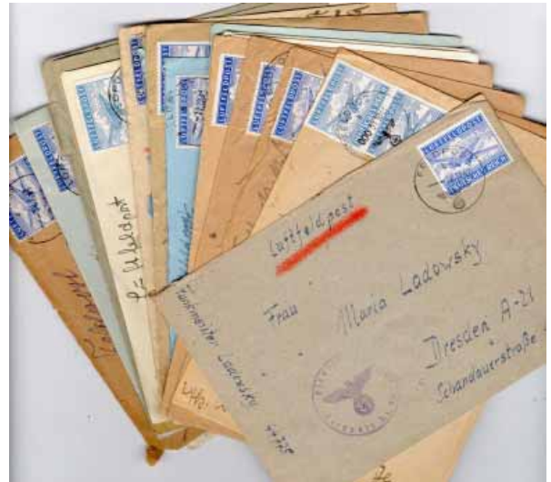
021642. AIRMAIL : batch of 22 covers all with blue Feldpost stamps (perf and rouletted, some pairs), all from the front (good variety of the 5-digit feldpost numbers) back to the homeland ..... £210.00