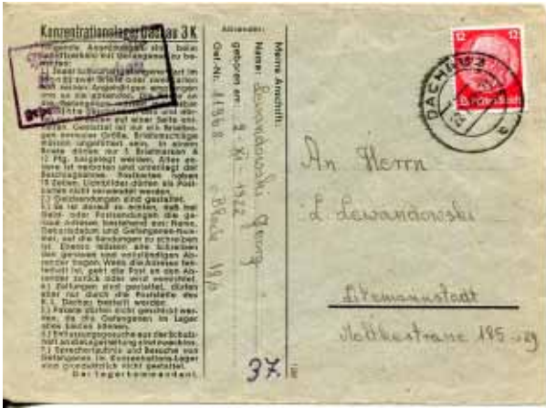
024868. DACHAU : 12pf Hindenburg on printed Dachau envelope, DACHAU cds, to Litzmannstadt, 1942 ..... £90.00