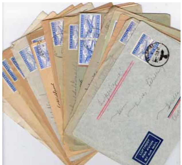
021641. AIRMAIL : batch of 21 covers all with blue Feldpost stamps (perf and rouletted, some pairs), all from the front (good variety of the 5-digit feldpost numbers) back to the homeland ..... £210.00