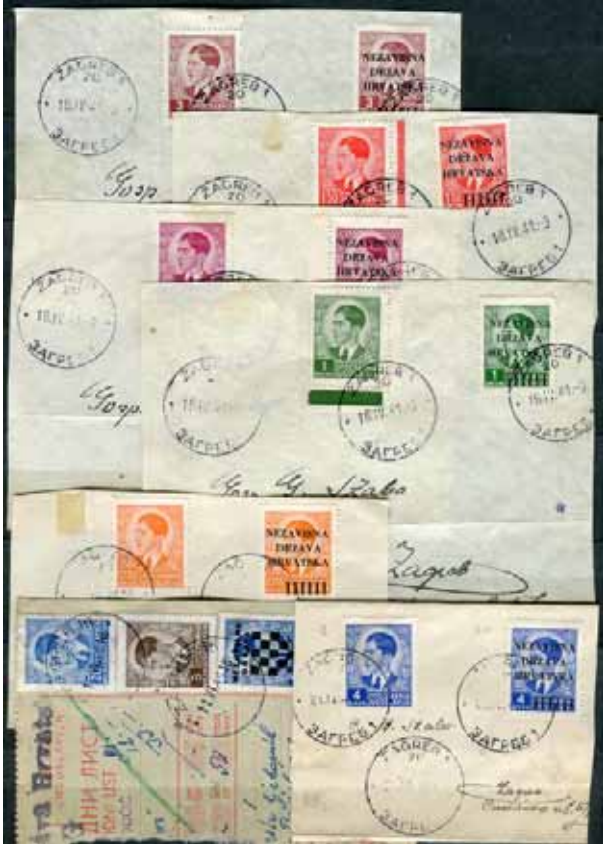
025244. 1941 MIXED FRANKINGS : Croatia/Yugoslavia mixed frankings, good variety of issues, all on large piece (7 items) ..... £50.00