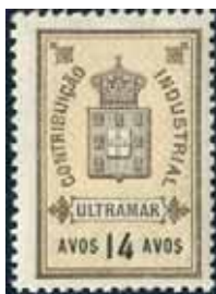
1899. Royal arms. Value in avos and patacas.

From this date, Portugal issued Contribuicao Industrial stamps for each colony in a common design and face value, but printed in special colours for each territory. The following were for use inly in Macau.