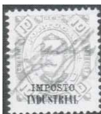
1898. King Carlos postal issue of 1894, ovpt IMPOSTO / INDUSTRIAL.