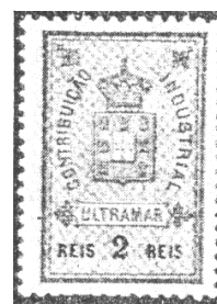
1907. As previous design, but value in reis and rupees.

The high values from 1P09 were printed but may not have been issued.