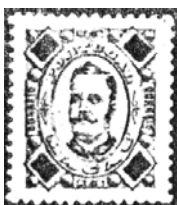
1898. King Carlos postal issue of 1894 with four value panels overprinted with a bar, but with no other ovpt and no indication of intended use (however, only intended for fiscal use).