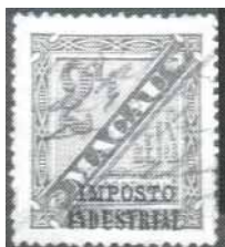
1898. Newspaper stamp of 1893, ovpt IMPOSTO / INDUSTRIAL.