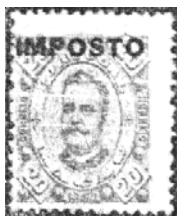
1898. King Carlos postal issue of 1894 ovpt 'IMPOSTO'. Value in reis. Perf 11½.