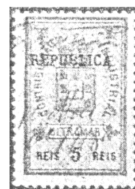
1912. Previous issue with horizontal ovpt 'REPUBLICA'. There exists both a local printing and Lisbon printing, very similar.

The 5r value of this series in brown, yellow & black was surcharged 'POSTAL / 1 AVO' for postal use.