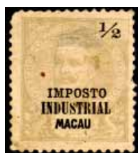
1898. King Carlos postal issue of 1898 with 'MACAU' in lower panel and with value in upper right panel, both in black, and with ovpt 'IMPOSTO/INDUSTRIAL' in back. Value in avos. Perf 11½.