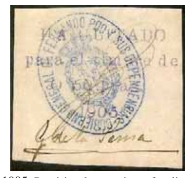
1905. Provisional typeset issue, four lines of text, dated 1905. Imperf.