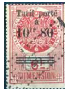
1929. Further new rates. Surcharged "Tarif porté / à" in two lines, new value, and three bars.