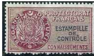
1939. Figures of value in black. Wmk AT. Perf 14.