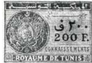
1956. Changed format, Arms with dark background. Wmk AT. Perf 13 (?).