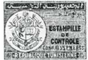
1958. Inscription changed to REPUBLIQUE TUNISIENNE. Wmk AT. Perf 13.