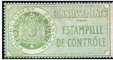
1929. Same design, new values. No wmk. Perf 14.