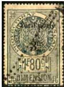
1920. Surcharged "Tarif porté / à" in two lines, and new value (but no bars).