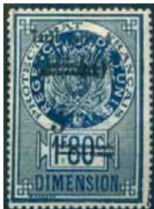
1919. Surcharged "Tarif / porté / à" in three lines, both previous values deleted by two bars, and new value inserted between the bars.