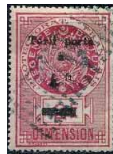
1924. Surcharged "Tarif porté / à" in two lines, but new value above the bars. Type face of the surcharge is smaller and often with clogged ink.