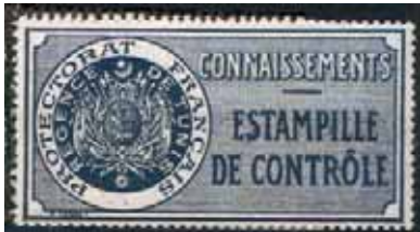
1922. A: Stamp with value; B : Control. No wmk. Perf 14.