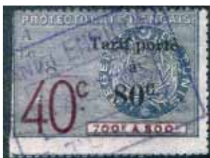
1920. Tax rates doubled. Issue of 1896 (dated "18--") with surcharge at right.