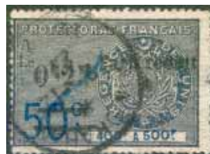
1923. Tax rates halved. Surcharged in black (various minor varieties exist with broken letters).