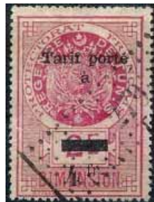
1923. Further new rates. Surcharged "Tarif porté / à" in two lines, and new value below the bars, in black, or in brown (Br).