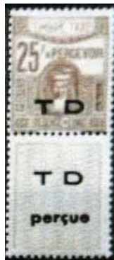
1947. Same design but stamp inscribed TIMBRE-TAXE.