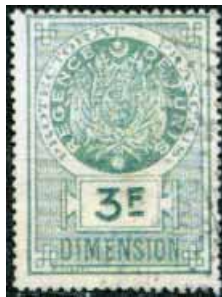
c1923. Key type, but with figure of value bolder.