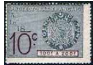
1896. Arms, dated "18--". Taxed at 5c per 100F. No wmk. Perf 13½.

Bills of Lading. The value range indicated below the coat of arms (e.g. 200F A 300F) is the range of goods value that was taxed.