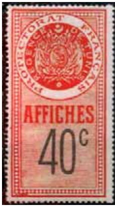
1924. Figure of value in black. No wmk. Perf 14.