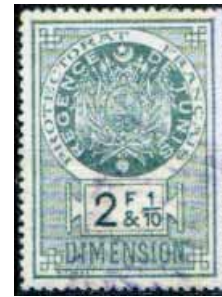
c1928. Key type with 1/10 fractional values.