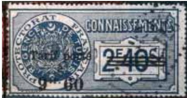
1928. Surcharged for new rates. Surcharge is only on the "A" portion, part "B" remains unsurcharged so same as previous issue.