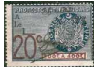
1915. Arms, dated "1---". Figure of value touches the date line. Taxed at 5c per 100F. No wmk. Perf 13½.