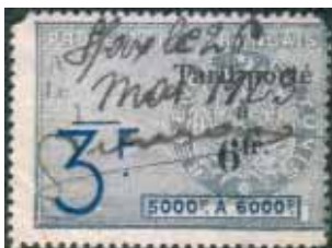
1920. Issue of 1915 (dated "11--") with similar surcharge at right. Minor variations of font exist.