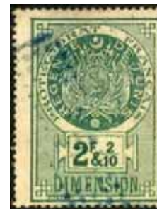
c1928. Key type with 2/10 fractional values.