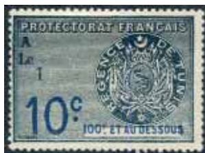
1922. Similar key type, but figure of value smaller (resulting in more space between date and figure of value), and "1" (for year) without following line. Taxed at 10c per 100F. No wmk. Perf 13½.