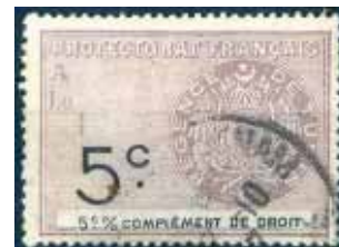
1922. Additional value to permit making up odd rates. No wmk. Perf 13½.