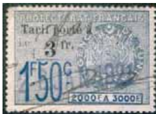
1922. Tax rates doubled. Surcharge at left. Various minor typesetting varieties exist in the surcharge.