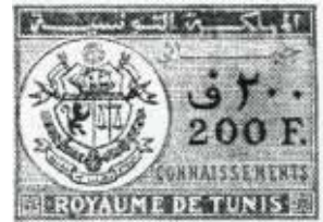
1957. Arms on white background. Wmk AT. Perf 13.