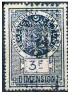
1920. Key type in new colours.